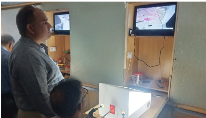
Hands-on training on BEST Endotainers