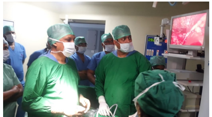
Live operative demonstration