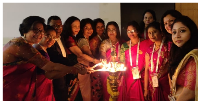
Inauguration at A.V Hospital & Hotel Lalith Ashok