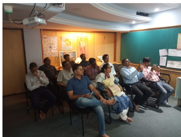
Didactic Session by Video- Conferencing from Delhi