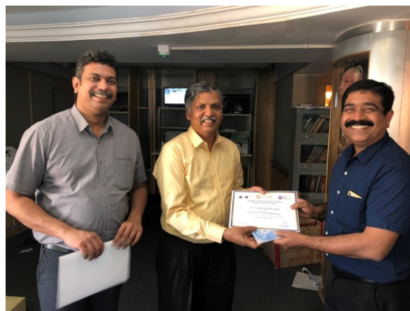
Distribution of course materials and certificates