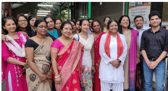
Organising team of AICOG