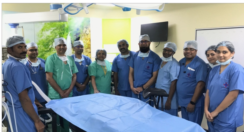
A.V Hospital Team Members